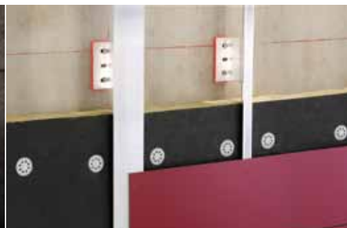
Fastening of insulation using Hilti anchors or Direct Fastening.