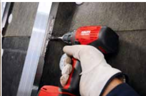
Quick and easy assembly of the façade using Hilti tools and fastenings.