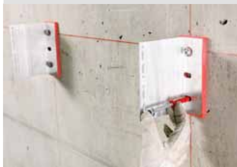
Hilti offers fixing solutions for concrete, masonry, wood and steel structures.